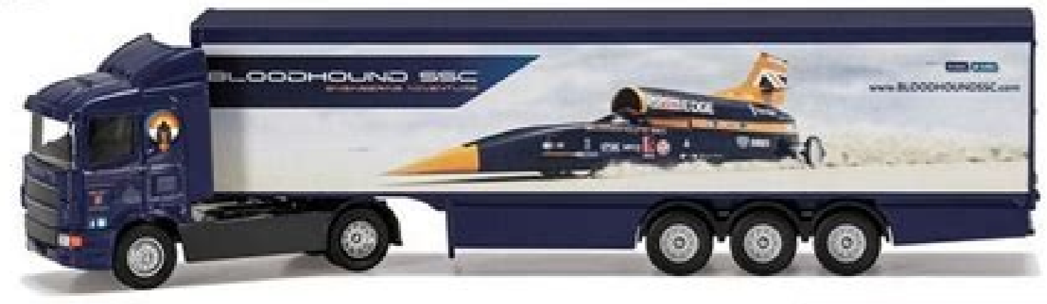
Image of a toy truck.