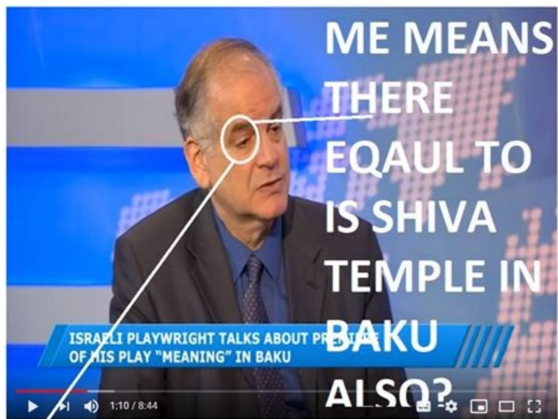
IDDO NETANYAHU'S INTERVIEW WITH CBC