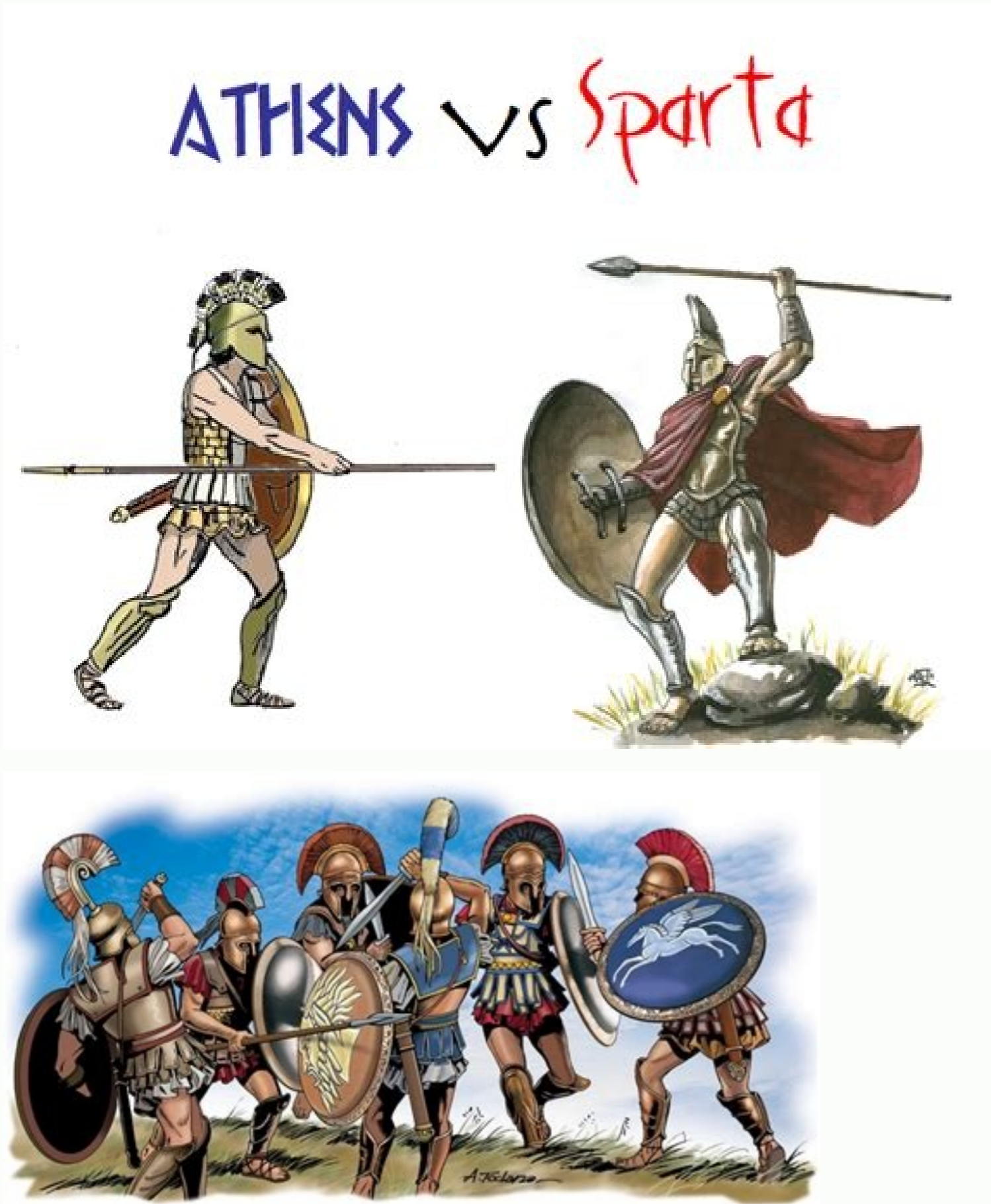
Compare spartan education and athenian education pdf. Compare and contrast athenian education and spartan education.

Similarities and differences The differences were that the military in Sparta was more important than in Athens. The similarities was that both countries encouraged education. The difference between education in Sparta rather than in Athens was that people in Sparta thought the purpose of education was to produce a disciplined army. Where as in Athens the purpose of education was to produce well educated citizens.