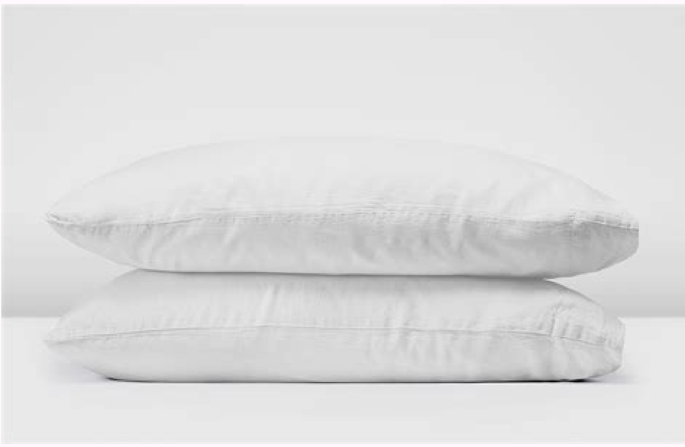
Best egyptian cotton sheets canada. Wamsutta egyptian cotton sheets canada. 1000 thread count egyptian cotton sheets canada. Long staple egyptian cotton sheets canada. Egyptian cotton sheets canada the bay. 1500 thread count egyptian cotton sheets canada. Certified egyptian cotton sheets canada. Egyptian cotton sheets canada sale.